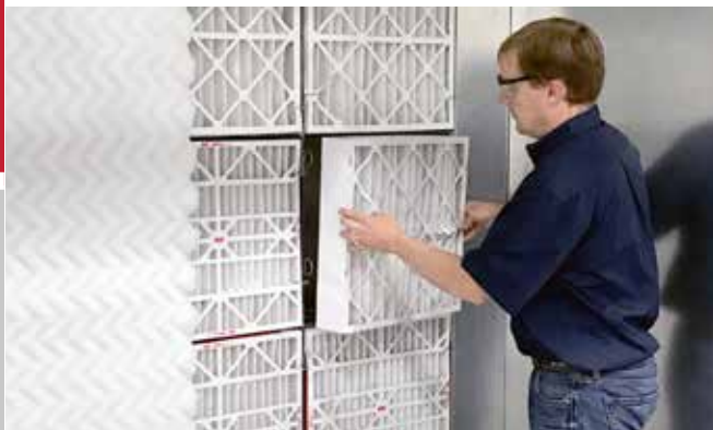
PRIMARY FILTERS GFS Wave® Roll Filter | Panel Filter