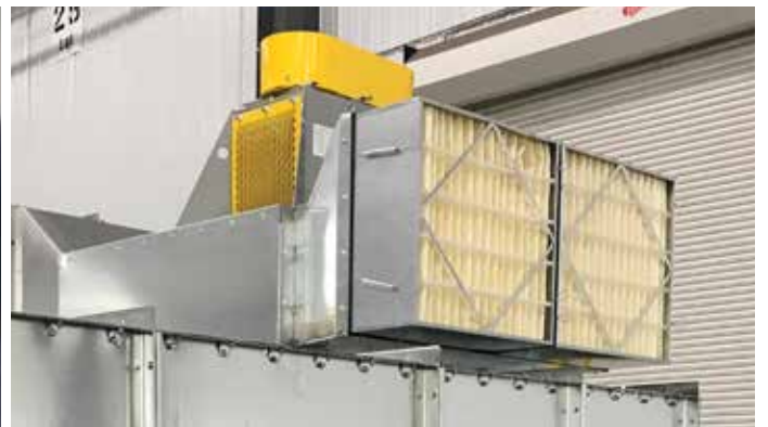
REDUNDANT FILTERS MERV 14 rated